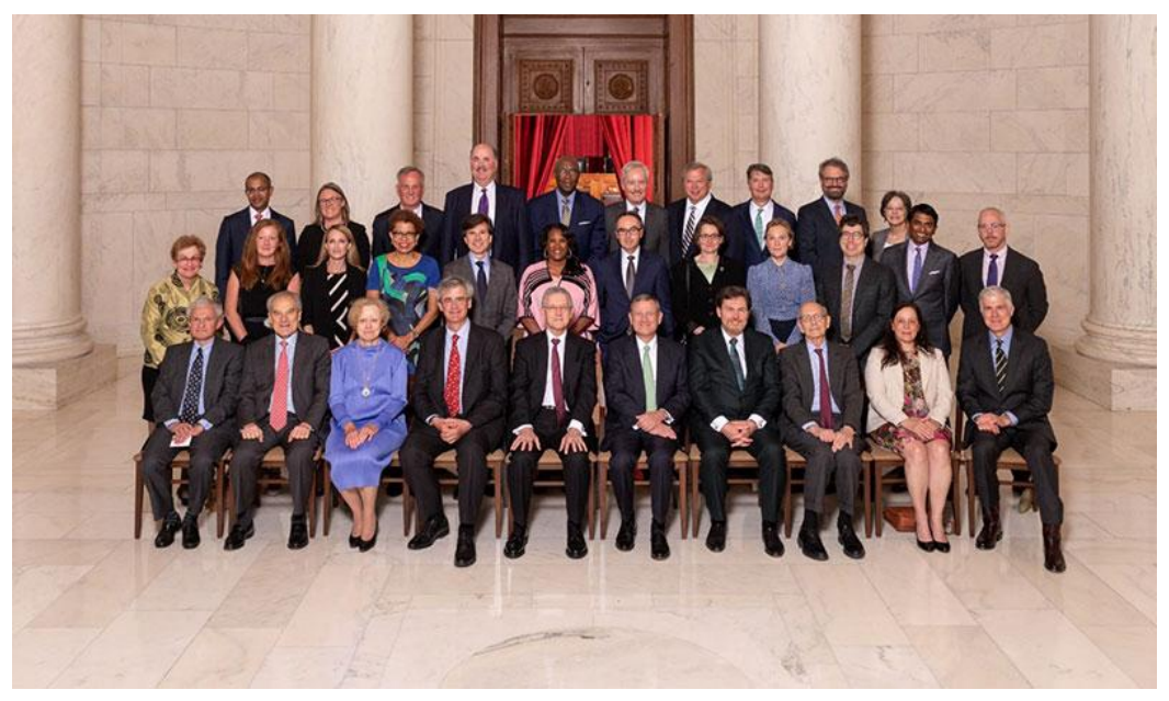
\hbox{@} Collection of the Supreme Court of the United States

In May 2022, the AMS and the <u>American College of Trial Lawyers</u> hosted a <u>Forum on the Rule of Law</u> with distinguished American and British Justices, judges, lawyers, and legal experts at the Supreme Court of the United States. The delegations discussed legal issues in a post-pandemic world, including the rule of law and national security, separation of powers, free speech and the Internet, human rights and civil liberties, climate, and the courts.